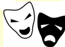
Watch and take part in performances