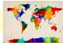
Study a range of artists from different cultures around the world