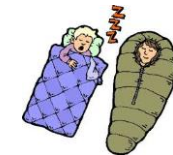
Go on a residential visit