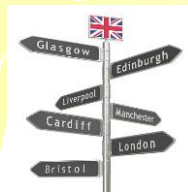
Visit a different City