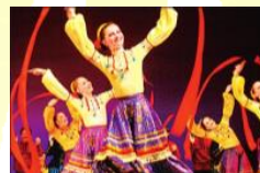
Learn about different cultures through a range of experiences