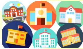
Work with other children in different schools in Hull