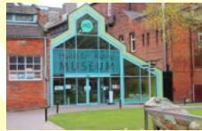
Explore museums in Hull