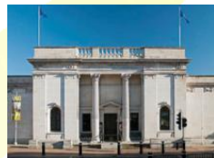
Deepen my understanding of literature, art and technology including a trip to Ferens Art Gallery