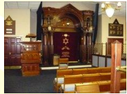
Visit different places of worship.