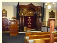
Visit different places of worship