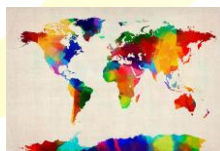
Study a range of artists from different cultures around the world