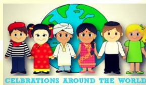
Learn about different celebrations around the world.