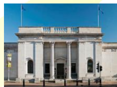
Deepen my understanding of literature, art and technology including a trip to Ferens Art Gallery