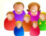
Share special times with our families