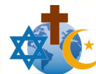
Learn about Judaism and Islam and their different beliefs and celebrations