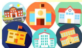
Work with other children in different schools in Hull