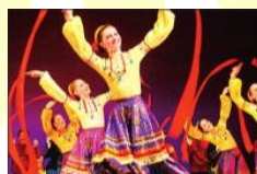
Learn about different cultures through a range of experiences