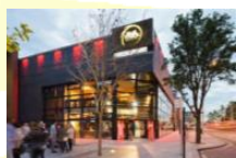
Visit the Theatre