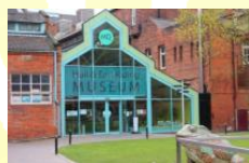
Explore museums in Hull