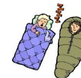
Go on a residential visit