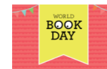
Take part in whole school Curriculum Days