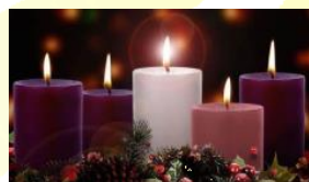
Prepare for Christmas during the season of Advent