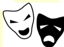
Watch and take part in performances