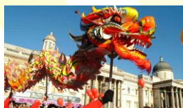
Celebrate Chinese New Year