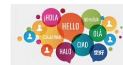
Celebrate different languages from around the world.