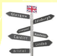
Visit a different City