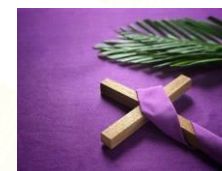
Observe the season of Lent in preparation for Easter