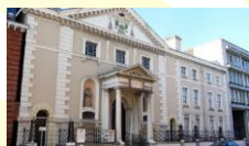
Take part in masses at St Charles